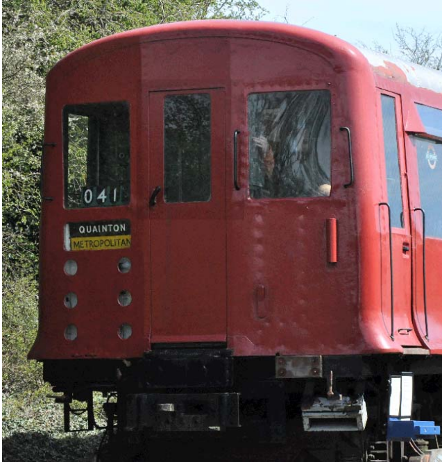
Various views of the former London Underground stock referred to above.

Open to the public over the weekend was the former London Underground stock that used to work the Metropolitan, Circle, Hammersmith & City, District and East London lines. I'm not going to refer to them as "tube" stock because technically they are not. They were too big and wouldn't fit in the tube tunnels.